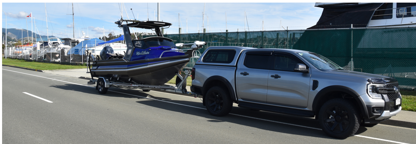
The rig – the Senator RC540 Miss B Haven and tow wagon, the Ford Ranger Sport V6 – ready for its first adventure