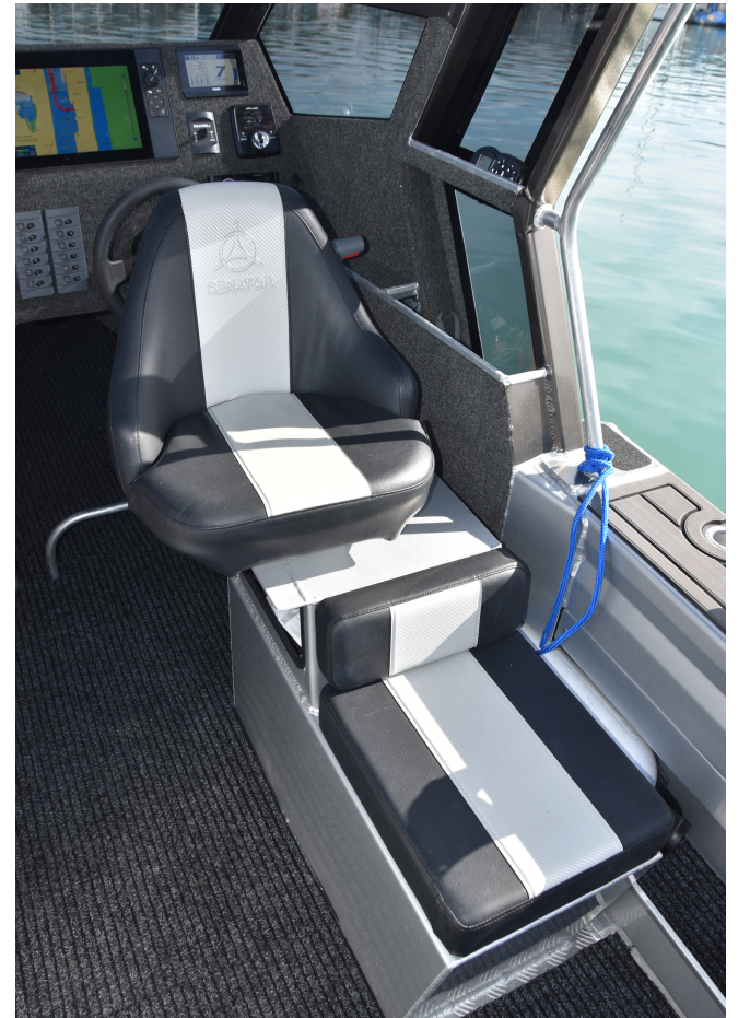
The king and queen helm seating arrangement features dry storage beneath

When I go fishing, I generally either go or come home in the dark. I love fishing the change of light and like having good lighting on the boat for both working lights but also fishing lights, hence the combination of using both red and white lights.