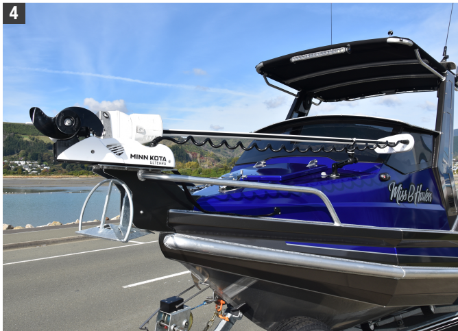
1) The business end – Yamaha F115, work area and extended fishing space. 2) The Senator's helm station is dominated by the Furuno TZT3 12" MFD. 3) The livebait tank and its intended occupants are very much a part of Dan's fishing arsenal. 4) The centrally mounted Minn Kota adds quite a few angling options.

nothing further that I wish I had included.