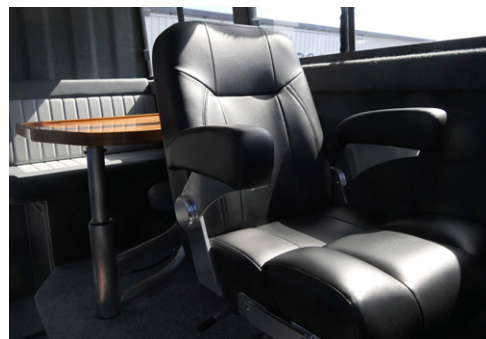
TAKE A SEAT

Comfortable sleeping quarters with generous storage space.