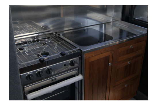
COMFORT AT SEA

Booth seating for up to 4 people with swivel seat option.