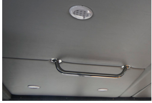
UPHOLSTERED CEILING WITH PREMIUM FINISH

Gimballed oven and comfortable galley complete the picture.