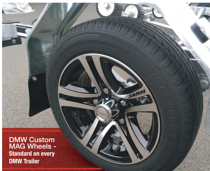
DMW Custom MAG Wheels - Standard on every DMW Trailer

Making an early start to beat the Auckland traffic, I drove down to Raglan where I met up