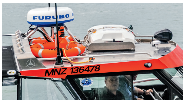
As a charter boat, Princess Moana is fitted with full safety equipment such as the life rings and RFD four-man liferaft on the roof.