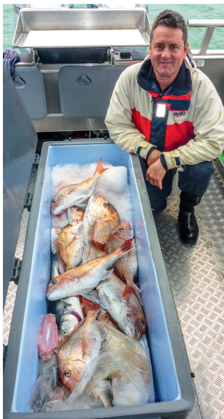
A 260-litre Ikey-Tek split-lid icebox provides ample catch and bait stowage.

shelves per side. There is no shortage of grabrails either.