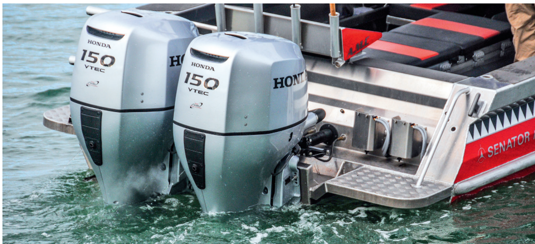
One of the advantages of twin engines is the ability to get home unassisted if one engine should fail. This boat is powered by twin Honda VTEC BF150As.