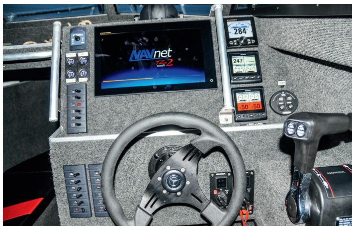
The electronics are based around a Furuno NavNet TZ Touch2 MFD.

In calm conditions inside the harbour with two adults on board, we found the boat could be lifted onto to plane by a single engine.