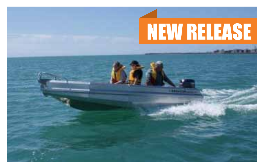
The IS400 has a high level of stability, load-carrying, resserve buoyancy and can be towed on a trailer easily by any family car, which makes these very useful, all-rounder crafts.

Can come in centre console configuration