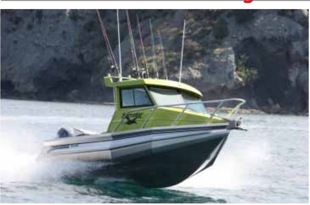
The spacious cockpit and wide top pontoon design are key features, along with the solid construction and stability ensuring a soft ride. The extra buoyancy high in the pontoon sides combined with the multi-chambered construction provides the ultimate in safety. You will be surprised at the features that Senator call standard, the quality of workmanship and the